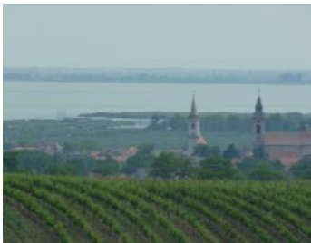
The Vineyards of Idyllic Burgenland