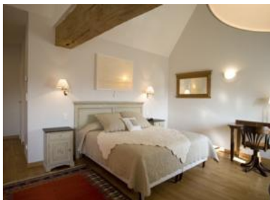
A Sample Bedroom