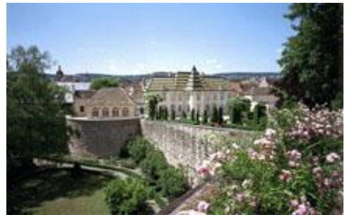
Chateau de Beaune

Today features two of the most fascinating wineries in Burgundy, both in the storied town of Beaune at the center of the region. Domaine Bouchard's headquarters is the Chateau de Beaune, where bottles are stored in underground cellars sheltered from vibration and temperature variations. Joseph Drouhin, which produces mainly Premier and Grand Crus, is sited at the Moulin di Vaudon, an 18th-century water mill. The day also features a walk around the old city and walls, a visit to the market for curios including Beaune's own mustard, Fallot, and a pique-nique in the Parc de la Bausaize.