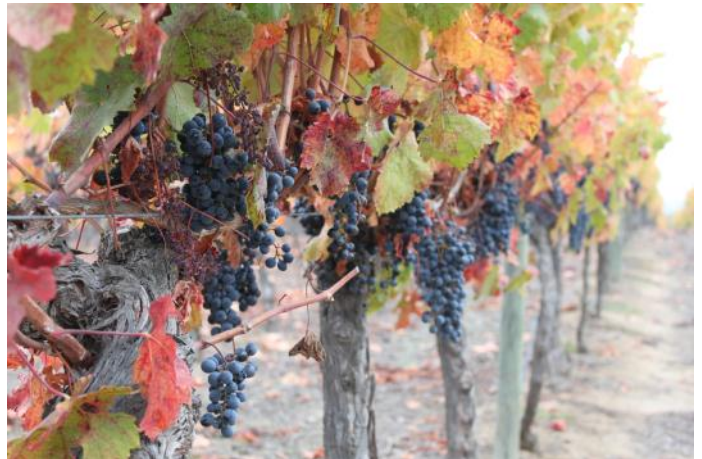
Grapes on the Vine

In The Narrative of the Honourable John Byron, a 1768 account of how Byron was shipwrecked on the coast of Patagonia, he described how “Chili wine, in my opinion, is full good”. Over 240 years later, Chilean wine continues to have many things in its favor, including a great diversity of micro-climates and Phylloxera-free soils, much of which can be farmed in an environmentally-friendly manner. Chile offers a broad range of varietals and styles—“Day-colored wine, / night-colored wine, / wine with purple feet / or wine with topaz blood”, as Pablo Neruda, the 1971 Nobel Laureate in Literature, put it. It is quite possible that the best sites in Chile have not yet been planted or even discovered. The possibility of greatness is always there.